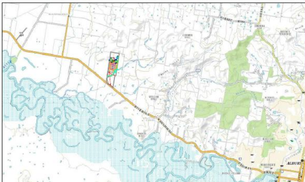
FIGURE 1: LOCALITY PLAN